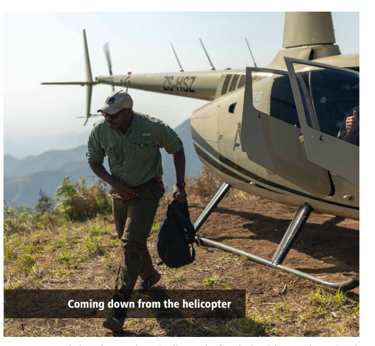
Park has been chronically underfunded with poorly trained and inadequately equipped rangers unable to tackle these threats. However, all of this has changed now.